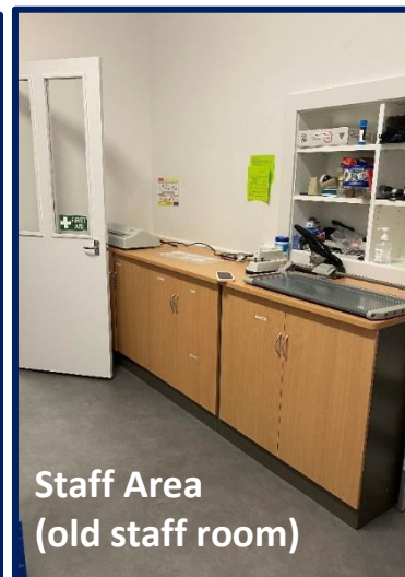
Staff Area (old staff room)