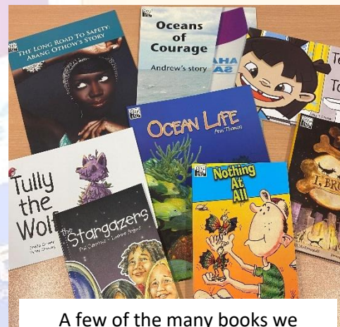
A few of the many books we received in our donated book box.

Recently a box of books was received from the Hospital School – they turned up with no information or letter. I emailed the principal to thank them and found out that we had been included in a very generous donation.